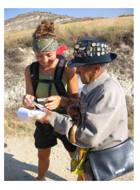
Barcelona, Spain