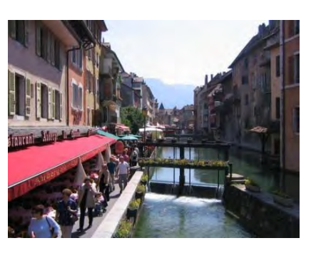
Annecy, France -Sarah Westmoreland

Almost all study programs in non-English speaking countries offer language coursework, but some programs are focused primarily on intensive language study. You might be able to complete an entire year of language study in a summer or get three semesters of credits in one semester's study. The following are examples from a long list of options; see a Study Abroad Advisor for more details.