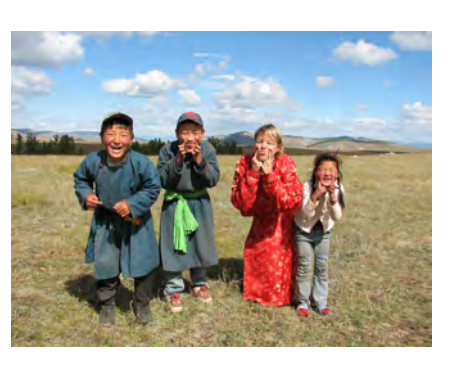
Mongolia - 'Glee'