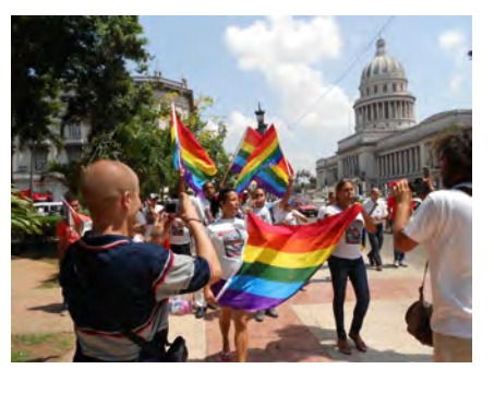
LGBT March in Cuba