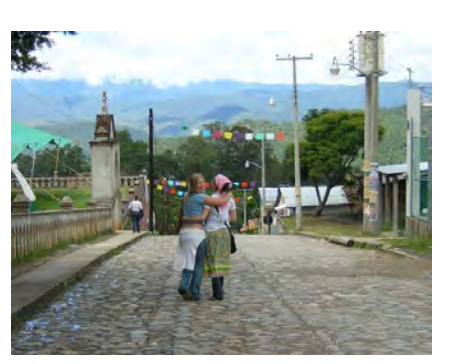
Oaxaca, Mexico