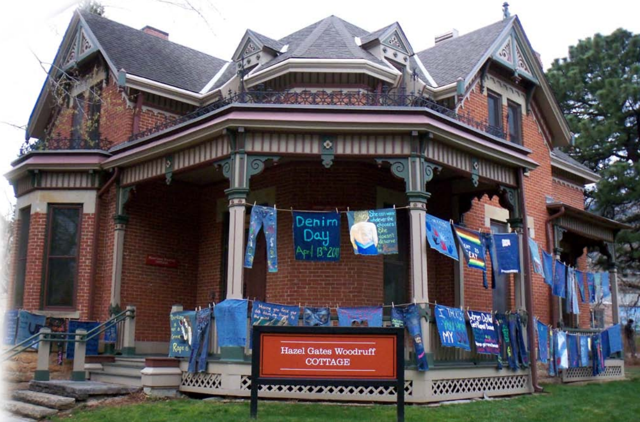
Students decorated the Gates Woodruff Cottage for Denim Day, April 13, 2011. (see p.6)

Silence never won rights. They are not handed down from above; they are forced by pressures from below. -Roger Baldwin