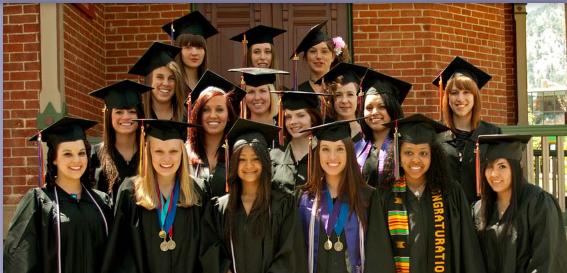
2011 Bachelor of Arts Recipients in Women and Gender Studies