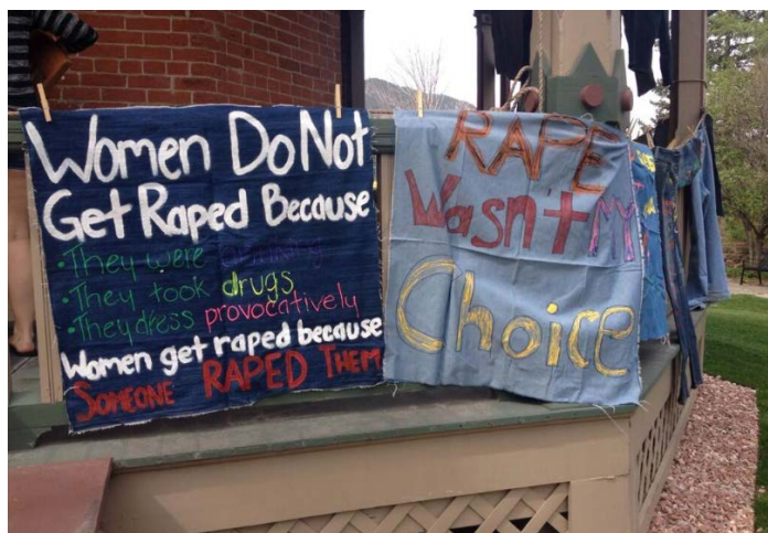
Denim Days Display Hazel Gates Woodruff Cottage April 24, 2014.