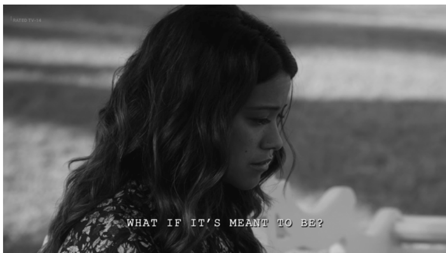
Figure 9.2. "What if it's meant to be?"

In general, the narrator and the textual elements guide the action and the audience's perceptions in Jane's favor. In this way both the narrator and the titles are invested in Jane, and thus they put forth a version of events that benefit her. This is true even when Jane herself is not on-screen. In episode 1.5, when Michael and Rafael are becoming competitive over Jane, the two have