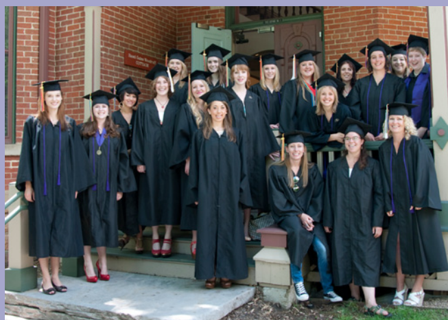
Women and Gender Studies Bachelor of Arts Recipients