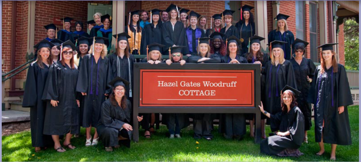
Women and Gender Studies Class of 2012