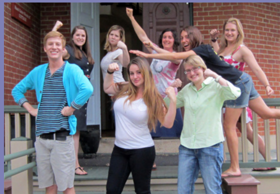
2011-2012 Gender Justice League members

wgst.colorado.edu/wp-content/uploads/2012/05/GJL-Newsletter-Spring2012.pdf