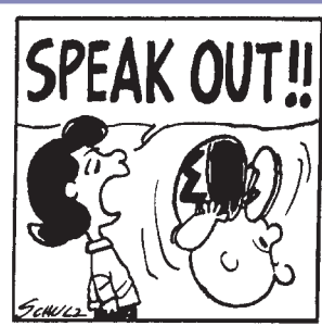
Peanuts—September 29, 1979