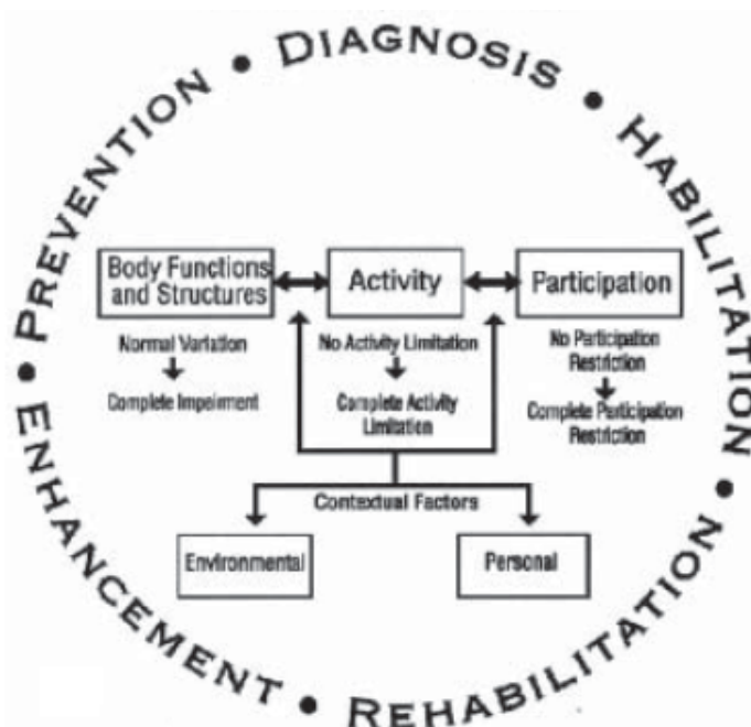
Figure 2. Application of WHO (2001) Framework to the Practice of Audiology

conversation with someone who is not familiar to you?” would be considered an assessment of Activity/Participation limitation or restriction. Questionnaires that require clients to report the magnitude of difficulty that they experience in certain specified settings can sometimes be used to measure aspects of Activity/Participation. For example: “Because of my hearing problems, I have difficulty conversing with others in a restaurant.” In addition, Environmental and Personal Factors also need to be taken into consideration by audiologists as they treat individuals with auditory, vestibular, and other related impairments. In the above question regarding conversation in a restaurant, if the factor of “noise” (i.e., a noisy restaurant) is added to the question, this represents an Environmental Factor. Examples of Personal Factors might include a person's background or culture that influences his or her reaction to the use of a hearing aid or cochlear implant. The use of the ICF framework (WHO, 2001) may help audiologists broaden their perspective concerning their role in evaluating a client's needs or when designing and providing comprehensive services to their clients. Overall, audiologists work to improve quality of life by reducing impairments of body functions and structures, Activity limitations/Participation restrictions and Environmental barriers of the individuals they serve.