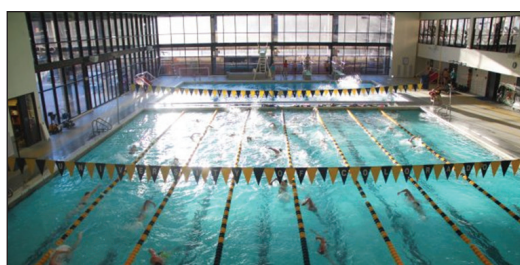
Competition Pool & Dive Well (Inside Rec Center)