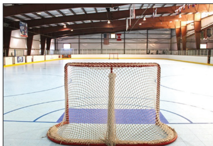
Table Mesa Dr, Boulder, CO 80305