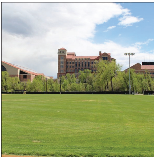
Lower Athletic Fields 1475 Folsom St. Boulder, CO 80302