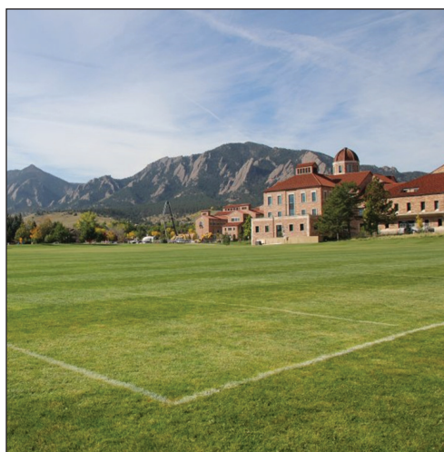
Business Field 995 Regent Dr. Boulder, CO 80305