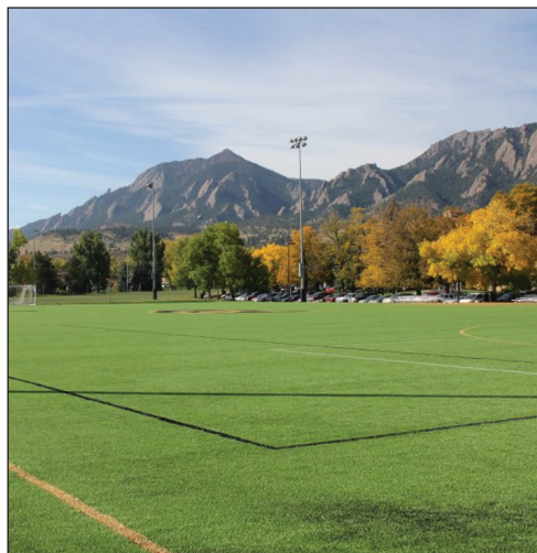
Kittredge Field 2510 Kittredge Loop Dr. Boulder, CO 80305