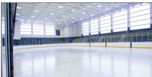
CU Ice Rink (Inside Rec Center)