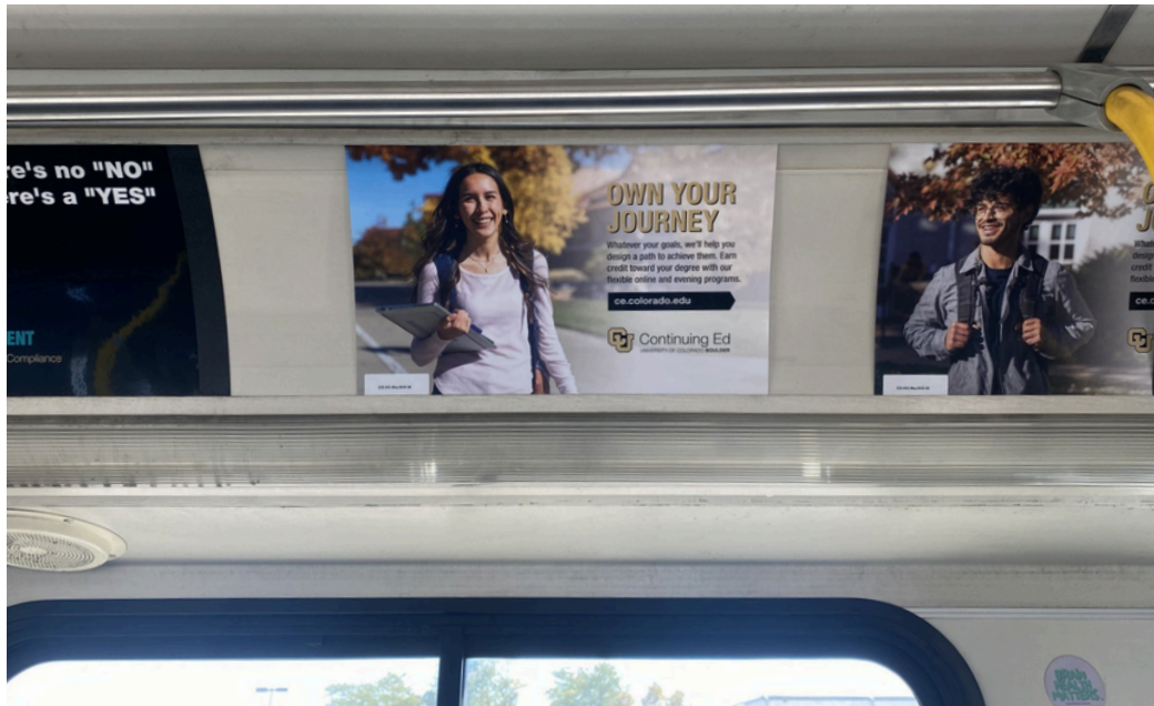
Image of Interior view of a Buff Bus featuring an 11"x17" interior cards displayed above the window

Cards are placed inside the bus, making them visible to passengers as they travel. These interior cards offer advertisers the opportunity to connect with riders during their journey, ensuring maximum visibility and impact for their messages.