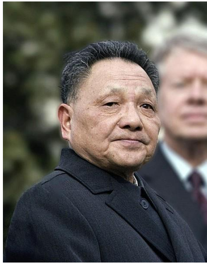
Deng Xiaoping and Jimmy Carter at the Arrival Ceremony for the Vice Premier of China.

In 1976, Deng Xiaoping became the new leader of China. He took over upon the death of the man who had been Communist China for nearly 30 years.