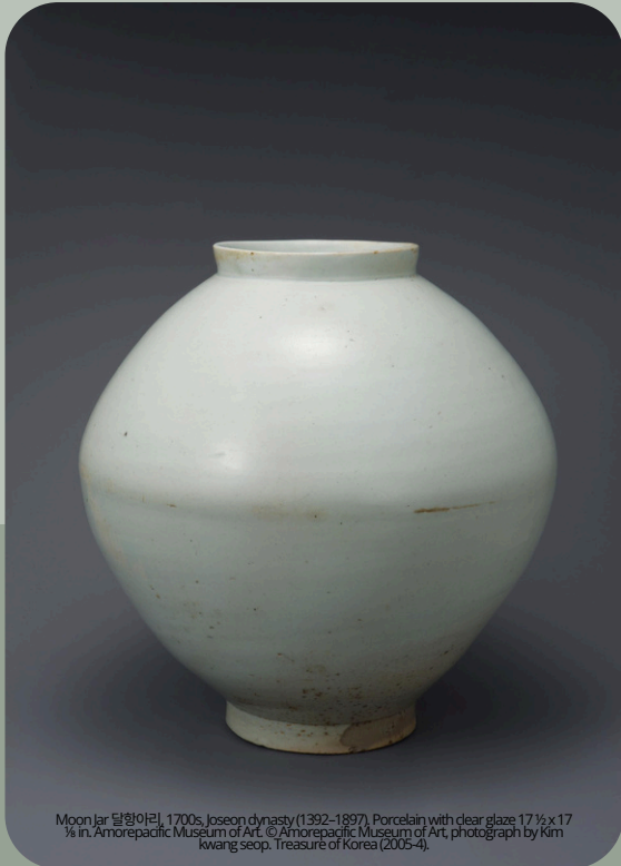
Moon Jar 달항아리, 1700s, Joseon dynasty (1392-1897). Porcelain with clear glaze 17 1/2 x 17 1/2 in. Amorepacific Museum of Art. Treasure of Korea (2005-4).

"Made for elite consumers in the 1600s and 1700s, the moon jar is an abiding symbol of Korean identity today." - Denver Art Museum