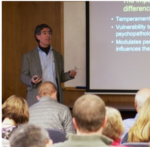
Professor Davidson at our department colloquium in December

Richie Davidson was instrumental in changing all of that. Now the William James and Vilas Professor of Psychology and Psychiatry at the University of Wisconsin-Madison, he has garnered awards that reflect how significantly he influenced the field of psychology—from the esteemed Distinguished Scientific Contribution Award from the American Psychological Association to being named as one of the 100 most influential people in the world by Time magazine. His work focuses on the connection between emotions and brain activity, known as affective neuroscience. He has also pioneered contemplative neuroscience: research on how contemplative traditions such as meditation can structurally change the brain.