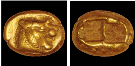
Electrum Trite, Mermnadai, Lydia, 620-564 BCE Obverse: Head of lion with sunburst (“wart”) on top of head. Reverse: Two irregular incuse punches. 13.5 x 10.4 mm, 4.6954 g