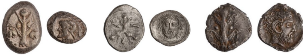
Left: Silver Tetradrachm, 525-480 BCE.