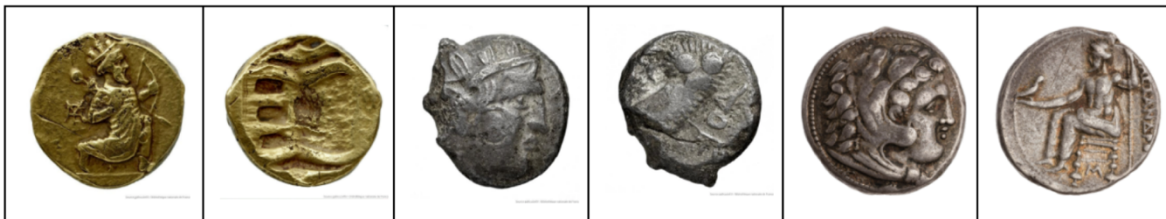
Fig. 1: Double Daric . 322-315 BCE. Gold. Bibliothèque Nationale de France