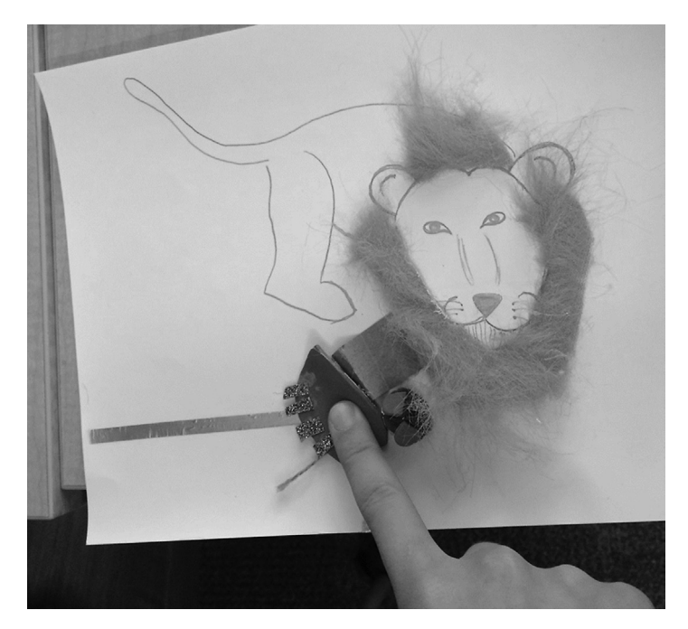
Fig. 1. Crafting a Tactile Retelling of the Fable, The Lion and the Mouse . This student is testing the sound button which will play the lion's dialogue when connected to makey makey and scratch. Rough glitter paper accentuates the claws and soft yarn expresses the lion's mane.