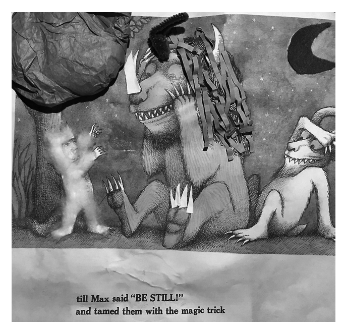
Fig. 3. Within a One-Session Workshop, Enhancing an Existing Illustration Allows Students to Focus on Texture and Sound Enhancement for their Illustration from Sendak's Where the Wild Things Are.

characters, and a variety of settings combined to make this classic text a good choice for experimenting with embedding sound and texture.