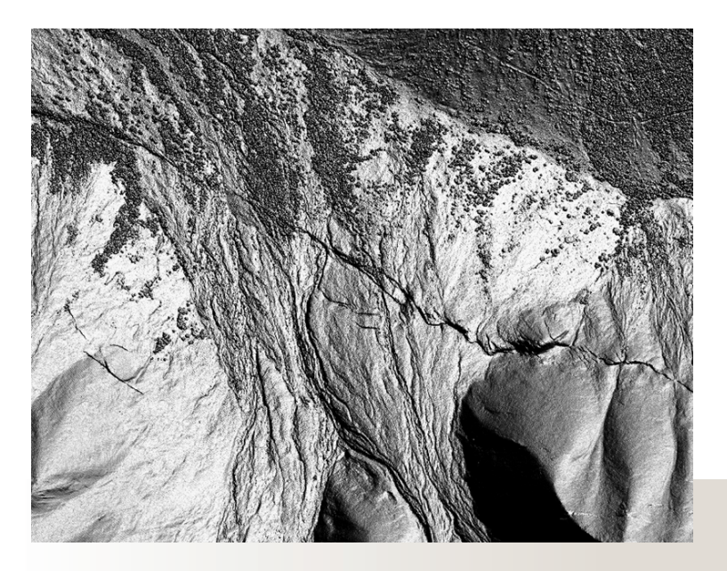
The 2002 Denali earthquake surface rupture crosses alluvial fans, as imaged in EarthScope lidar data.

Topography datasets are freely available online through OpenTopography, an NSF-funded data distribution portal, and have been used by the active faulting community to generate new and important insights into earthquake processes. For EarthScope data alone, 200 billion points have been processed by 1400 users on the OpenTopography site.