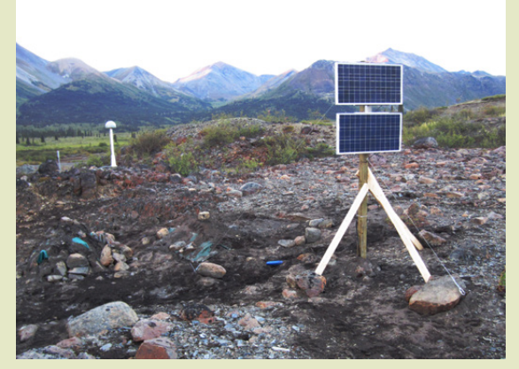
Installed seismometer and continuous GPS site at Macmillan Pass.

The stations will run until summer 2018. Over the next couple of years, they will need periodic visits for maintenance and data collection. After the logistical hurdle of installation is cleared, a fantastic dataset will emerge, allowing scientists to fill in the blanks in this geophysical terra incognita.