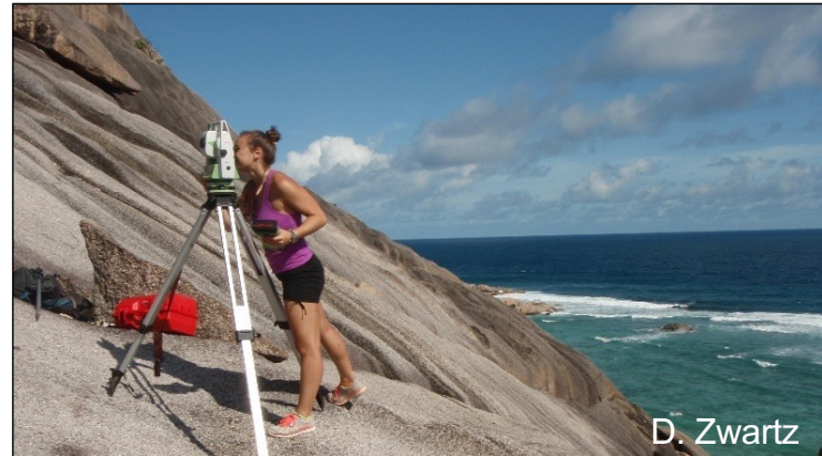
Person conducting fieldwork.