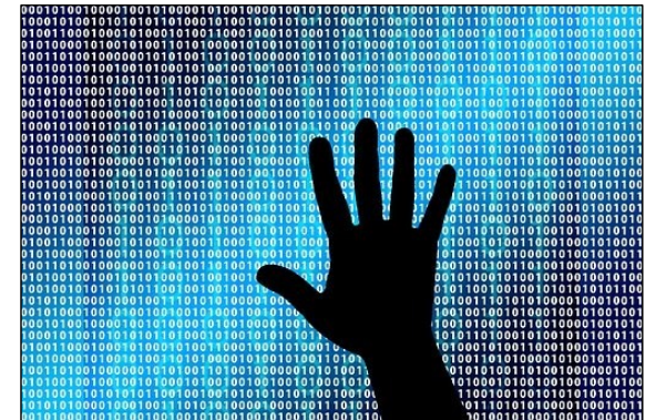
Hand with computer code.