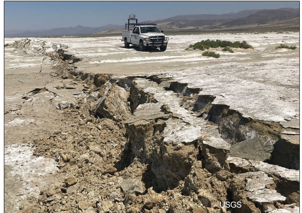
Surface rupture from the Ridgecrest earthquake

Deformation of the Earth occurs over a spectrum of rates and in a variety of styles, leading geoscientists to reconsider the very nature of earthquakes and their dynamics.