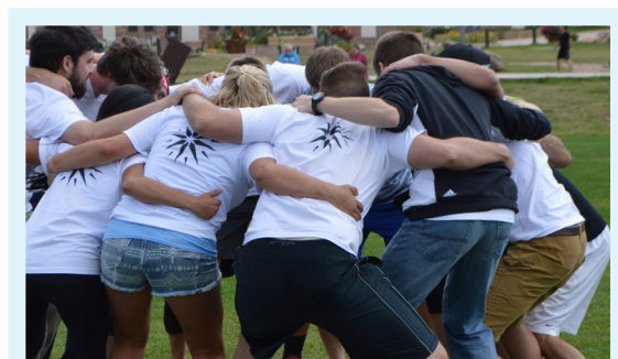
Orientation 2014 Staff Team