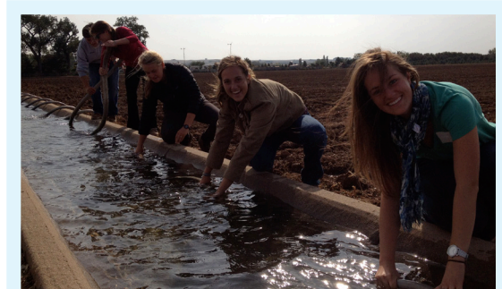
Agriculture Experiential Weekend