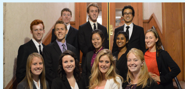
Thursday Recitation Group

The most important leadership lessons you will learn in your time with PLC will be through your experiential education endeavors. You will have the opportunity to practice leadership both on and off campus. At PLC, we recognize that the best way for you to learn how to lead and how to follow is by experiencing both.