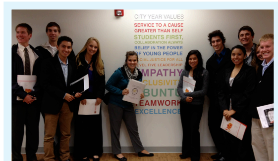
Education Experiential Weekend