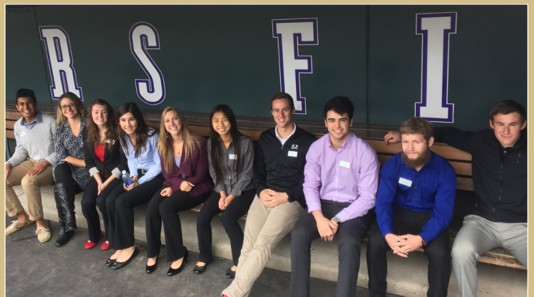
Coors Field - Rockies Dugout