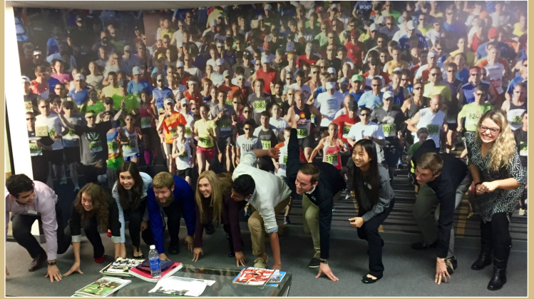
Bolder Boulder Headquarters