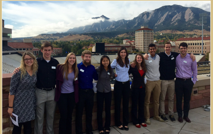
Champion Center - Folsom Field