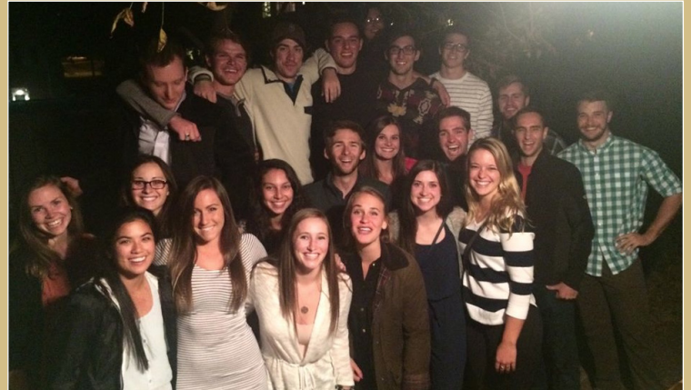
Class of 2012 - Senior Class BBQ

We are sending this newsletter to over 2100 alumni and other supporters. If each alumnus and alumna donates $23, reaching that $46,000 goal will be easy. I will provide that our generous