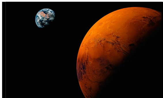
Earth and Mars: two things that had origins