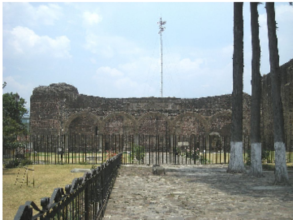
Chapel in Tlalmanalco, Mexico

Raul: I'm mainly interested in metaphysics, in very general questions about the nature and structure of reality. At the moment I'm