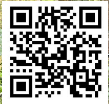
Ecuador