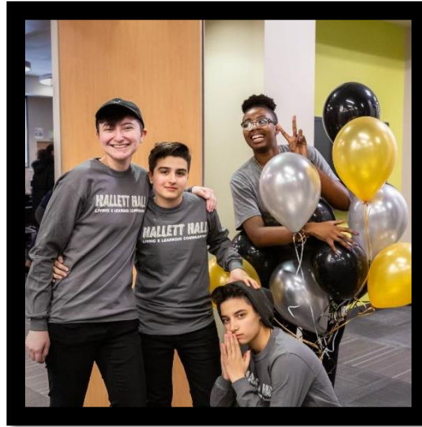
Living Learning Community (LLC)