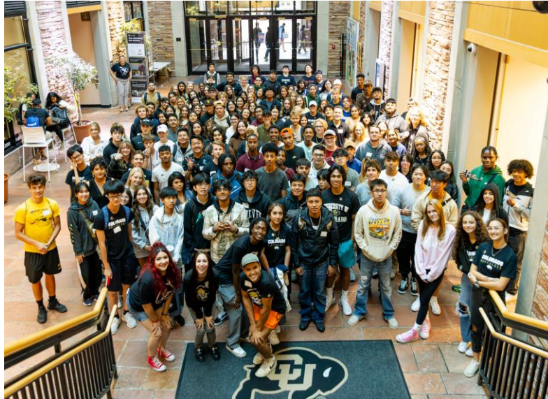
FIRST-GENERATION WELCOME KICKOFF