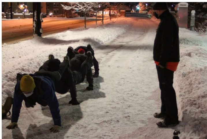
Colorado Meet 2021