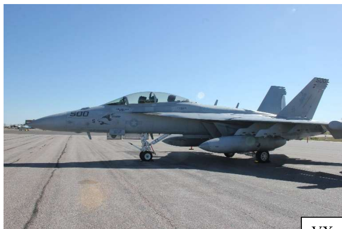
VX -31 Squadron Visit