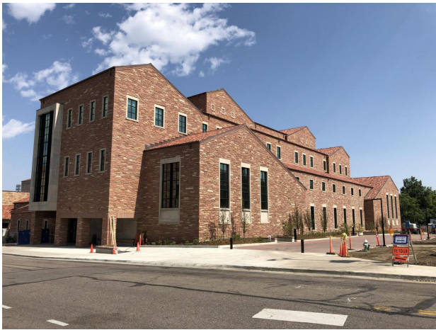
Virtual Tour of the Imig Music Building Addition: https://www.youtube.com/watch?v=IzVMh3RxOX4