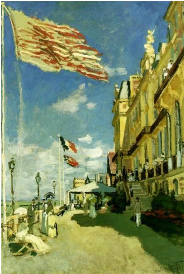
Hotel des Roches noires a Trouville