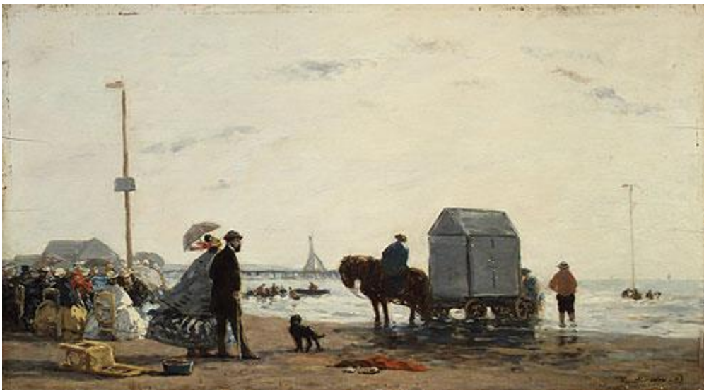
Scène de Plage - Ciel d'orage