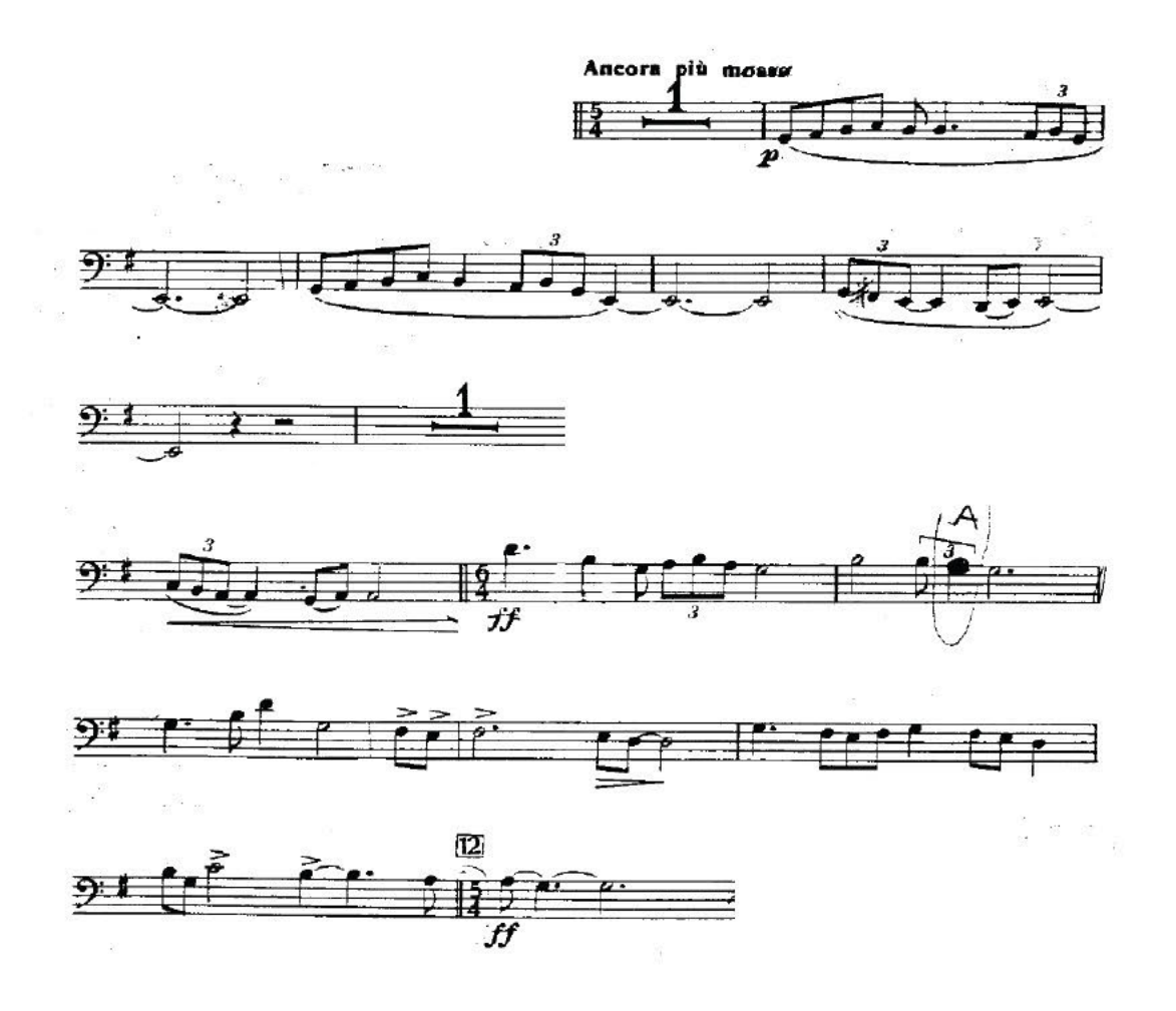
Haydn – The Creation

III. Additional excerpts for Orchestra/Wind Symphony consideration – play in this order Respighi – Pines of Rome