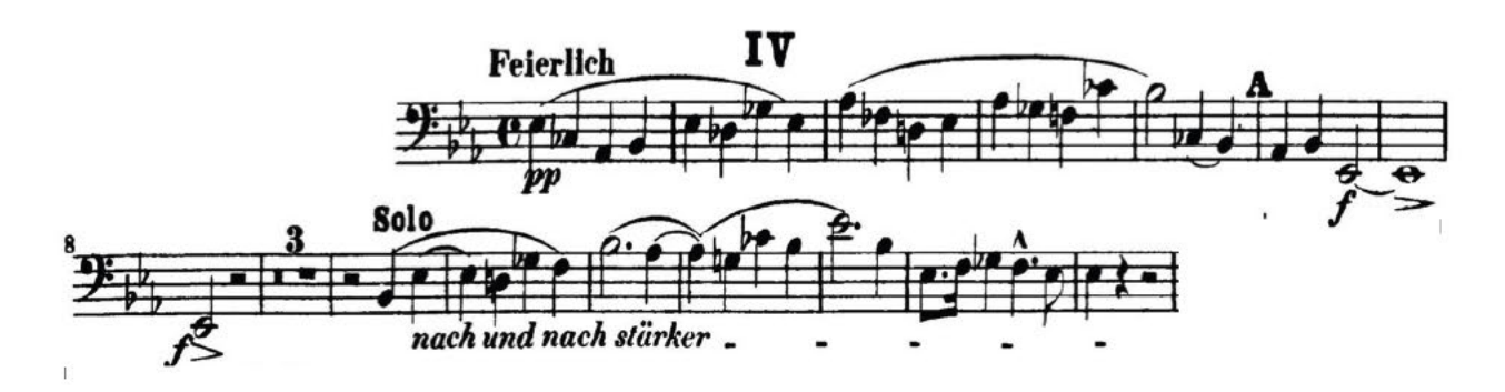
Berlioz - Hungarian March