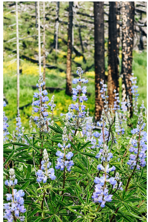
East Troublesome Burn Scar

To support the ongoing housing needs of currently underserved residents, BCHA is also looking to create inclusive housing that incorporates the needs of the Intellectual and Developmental Disability (IDD) community.