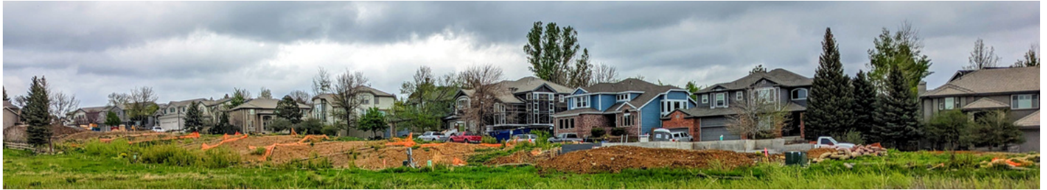
Coal Creek Crossing neighborhood reconstruction - 2 years after the Marshall Fire