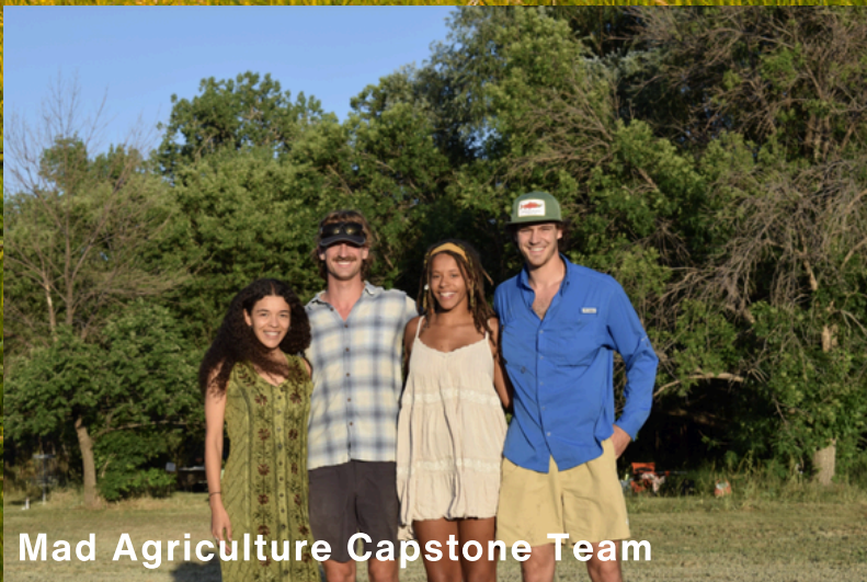
Mad Agriculture Capstone Team