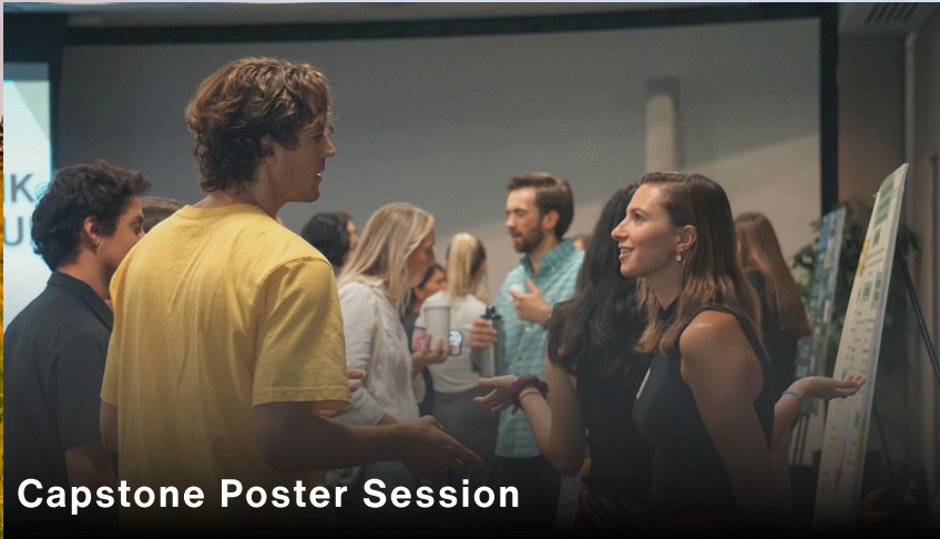
Capstone Poster Session