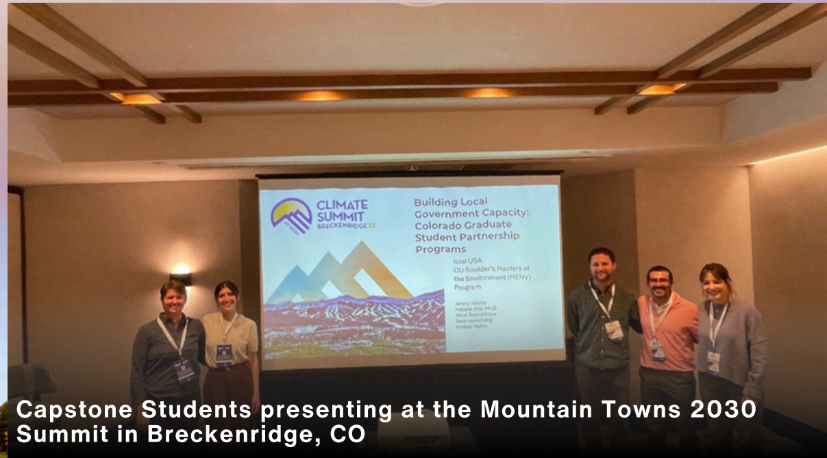
Capstone Students presenting at the Mountain Towns 2030 Summit in Breckenridge, CO

In 2026, ALL students were paired with one of their first three choices and 63% of students were paired with their first choice.