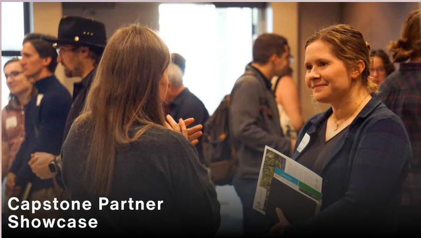
Capstone Partner Showcase