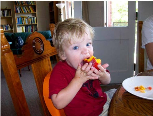
Needs of international students:

units being priced at or near market rates. It is also believed that the market can accept that a portion of the graduate housing could be developed at much higher densities. Developing graduate housing at more urban densities (40-60 DU/acre) could be successful if close in access to complimentary services and support facilities are available to the population and would not require dependence on personal vehicles. Offering a range of housing densities and locations provide options and choices that currently do not exist on campus for such a diverse market.