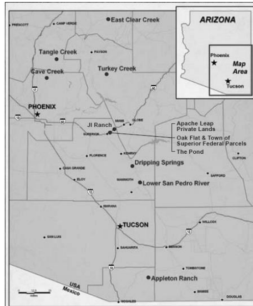
Figure 2. Land parcels involved in the Southeast Arizona Land Exchange and Conservation Act. 73

Members of Congress began introducing legislation concerning Oak Flat in 2005 with the introduction of H.R.2618 and S.1122 (Southeast Arizona Land Exchange and Conservation Act of 2005) (the “SALECA” of 2005). Under those identical bills, the government would have conveyed 3,025 acres of national forest land to Resolution in exchange for approximately 4,814 acres owned by Resolution. 74 Neither bill passed. 75 Successive versions of the SALECA were introduced in subsequent Congresses (see Table 1). Altogether, members of Congress introduced bills proposing the land exchange seven times in the House and six times