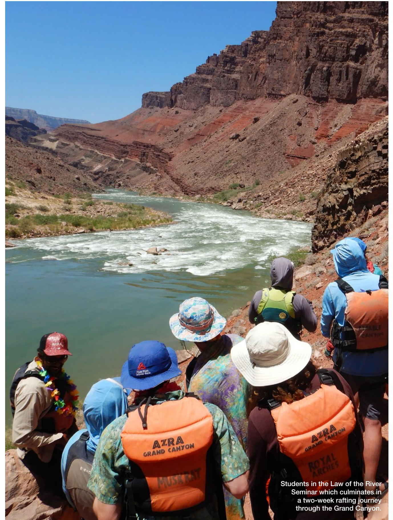
Students in the Law of the River Seminar which culminates in a two-week rafting journey through the Grand Canyon.