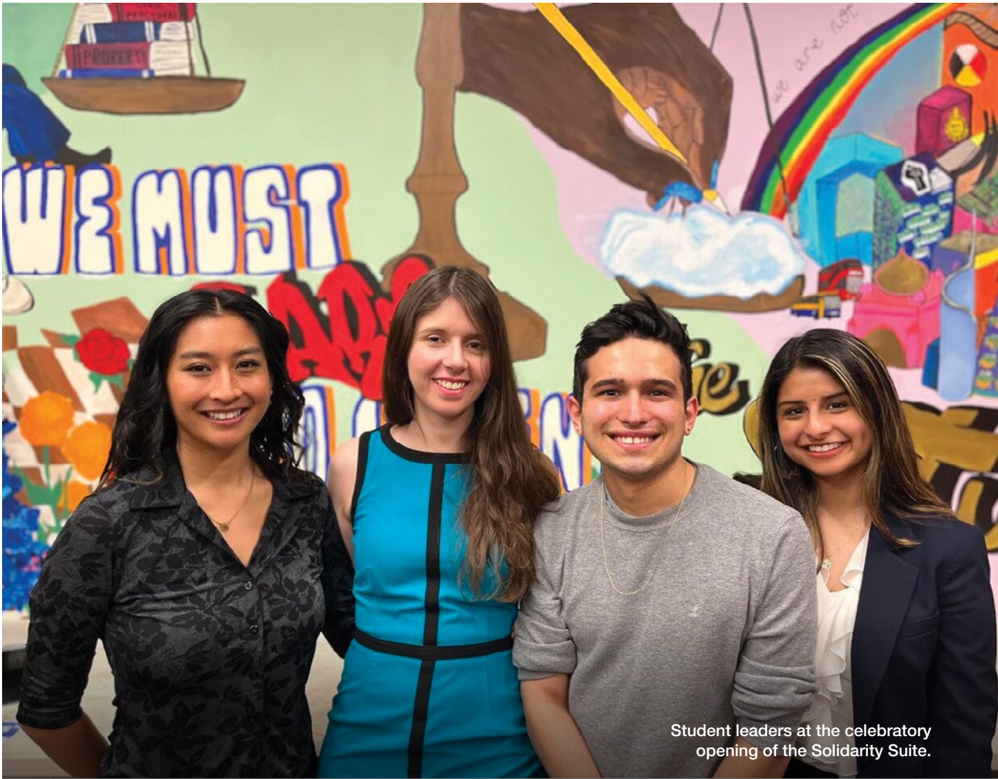
Student leaders at the celebratory opening of the Solidarity Suite.

It’s no coincidence that Colorado Law consistently ranks in the top 10 law schools for quality of life.