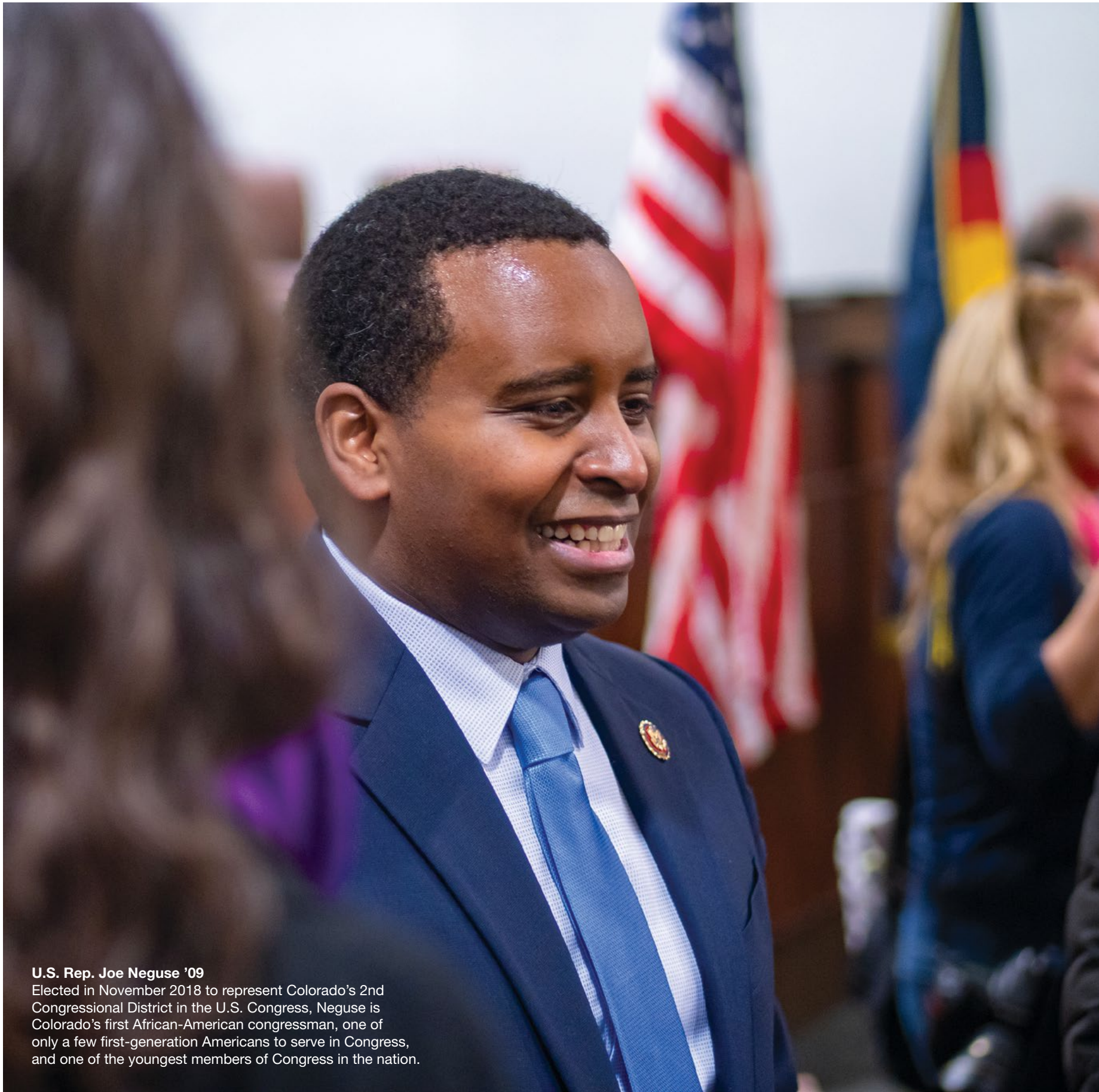
U.S. Rep. Joe Neguse '09 Elected in November 2018 to represent Colorado's 2nd Congressional District in the U.S. Congress, Neguse is Colorado's first African-American congressman, one of only a few first-generation Americans to serve in Congress, and one of the youngest members of Congress in the nation.