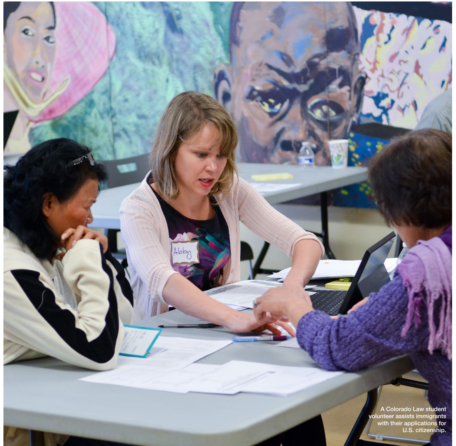
A Colorado Law student volunteer assists immigrants with their applications for U.S. citizenship.

Students advocate in the public interest concerning technology issues in front of regulatory entities, courts, legislatures, and standard-setting bodies.