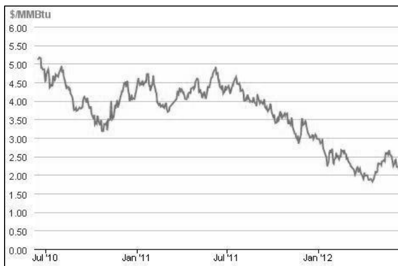
Figure 1. Natural Gas Spot Prices (Henry Hub). 3

Probably the most significant market evolution underway is the flat/declining demand for energy in the developed countries, coupled