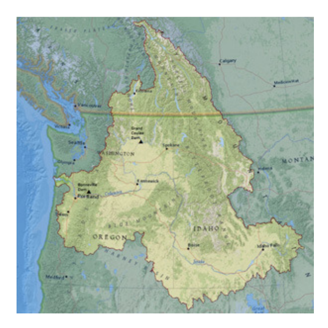
Figure 1: Columbia River Basin and the major dams in the hydropower system<sup>1</sup>