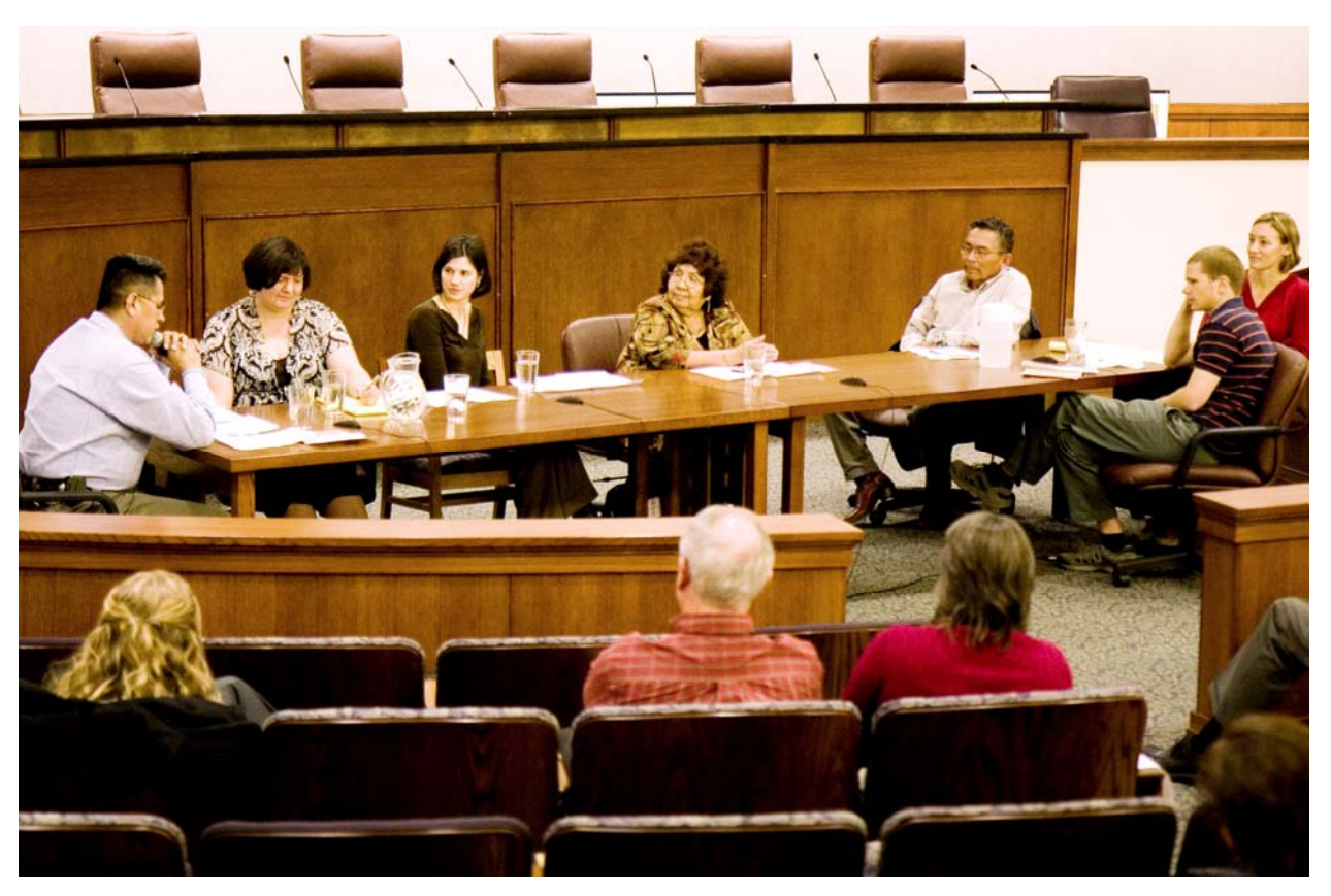
Clinic students participate in mock peacemaking session

This experience was highly educational for all of the viewers. It was an eye-opener for the law school students to see a tribal court in action and to observe the similarities and differences. It was a great experience for those of us studying American Indian law because the traditional tribal laws are so different from the federal Indian law that is the primary focus of our law school classes. Projects like this are a great way to expose the public to tribal courts and Indian Law. There are many people that do not know that tribes have governments, let alone tribal courts, so this was also a project to raise awareness. The experience of bringing these two court systems to the law school, as well as the fundraising process, was a wonderful experience for me. It was not an Indian Child Welfare Act case, or a code writing project, but it was definitely an important learning experience. .