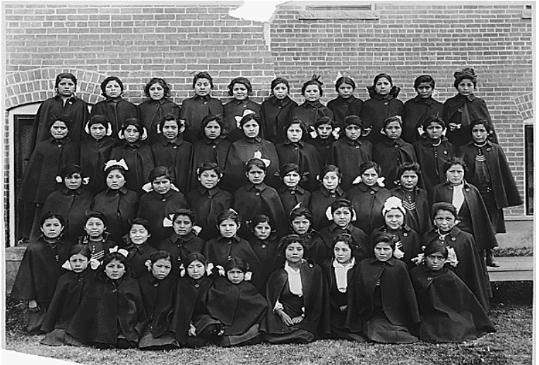
American Indian girls in uniform at Albuquerque Indian School.

at helping nudge the law toward justice than tribes and their members. As I see it now, ICWA continues to be relevant and important not least because of the boarding schools' legacy of loss of family.