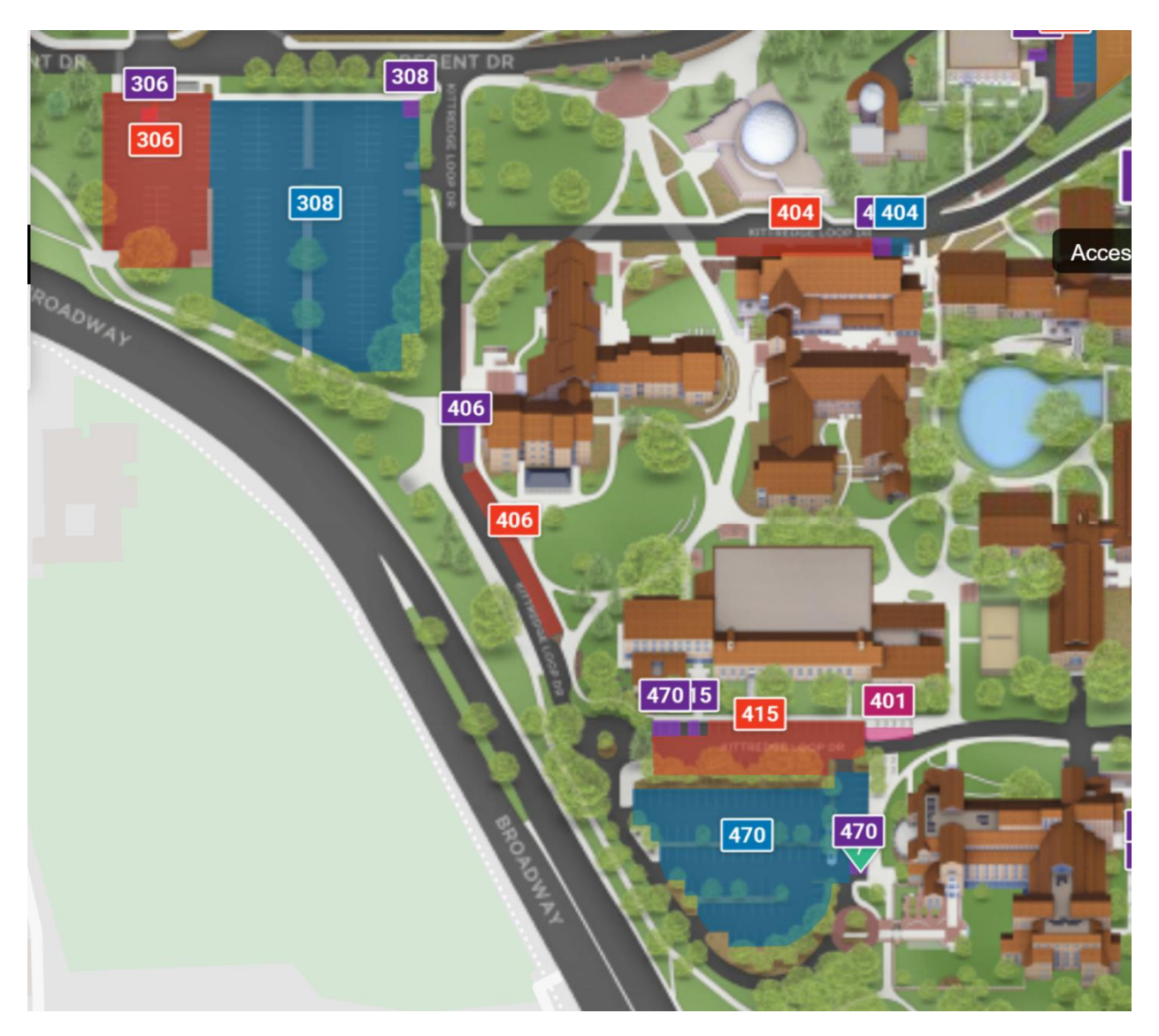
Parking is available for the event for $2 from 6-7PM and $1 from 7-8PM in lots 306, 308, 406,and 415.