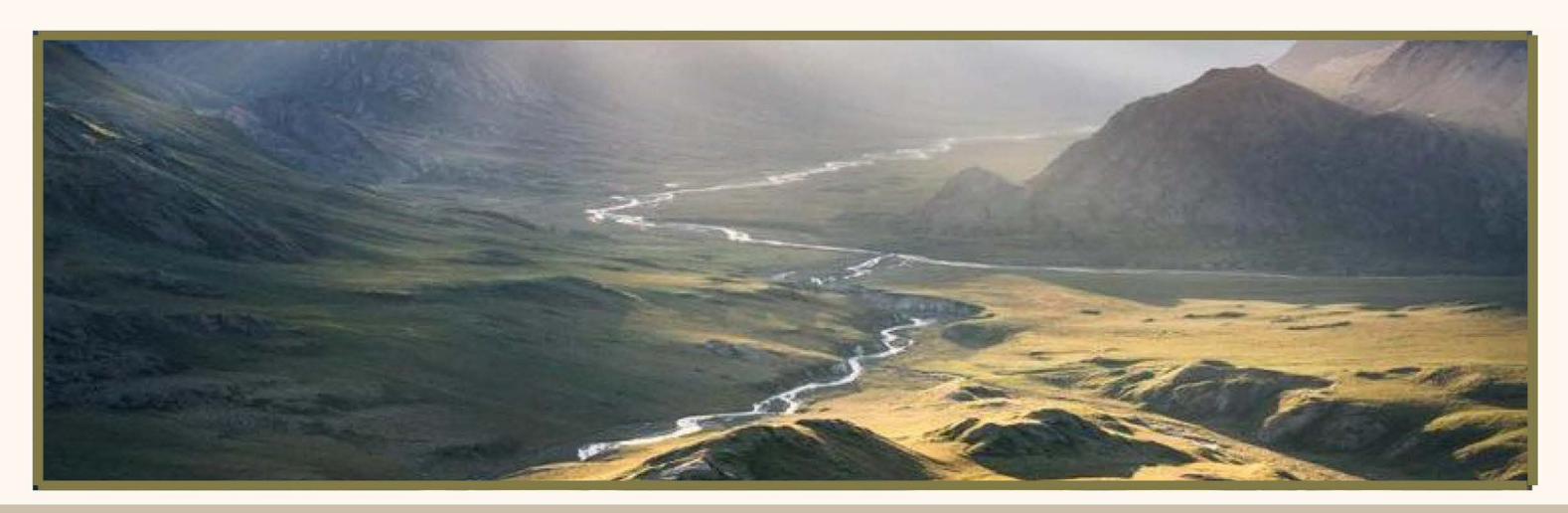
<u>First Peoples Worldwide</u> operates at the intersection of business, law and finance to work from a foundation of Indigenous values to achieve a sustainable future for all. Housed at the Center for Native American and Indigenous Studies, First Peoples partners closely with faculty from around the University of Colorado, including Leeds School of Business and the Law School.

With the work of American Indian Law Clinic's student attorneys, First Peoples has worked to elevate the rights of the Gwich'in people in the face of potential oil and gas development in the Coastal Plain of the Arctic Refuge. The Gwich'in Steering Committee, formed in the late 1980s to unify Indigenous voices and protect the sacred calving grounds in the Refuge. The Refuge, which is a sacred and ancestral land for the Gwich'in, was re-opened to oil and gas development through a rider to the 2017 Tax Act. Since then, the federal government fast-tracked lease sales and seismic exploration despite a growing public resistance. First Peoples built the capacity of the Gwich'in to meet with financial institutions and activate an international strategy, creating broader international awareness of the human rights violations that could occur should drilling take place. Not only do these efforts call upon international bodies to take action, but they also build the business case to deter financial institutions and other corporations from engaging in development.