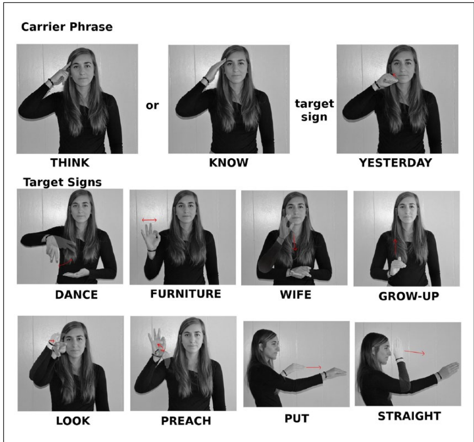
Figure 1. Illustrations of the eight target signs and two carrier phrases.

The STI is calculated by normalizing the displacement (Z-score) and temporal record of each movement trace following procedures established by Smith et al. (1995). After temporal normalization of all trials for a given sign to produce 1,000 time points, the standard deviation across the 10 displacement normalized trials was sampled at 2% intervals. The standard deviation (SD) indicates the temporal and spatial variability at a single point. By summing the SD values for each sign, an index of variability was derived that allowed an estimate of variability across the trials. Lower STI scores thus indicate more consistent or less variable movements. For each participant, an STI value was calculated for each sign. Averages of the STI values were then compared between the groups. In order to assess whether increased variability was driven by increased duration of utterance, the production duration of each sign in real-time based on the marker points was also recorded for each trial.