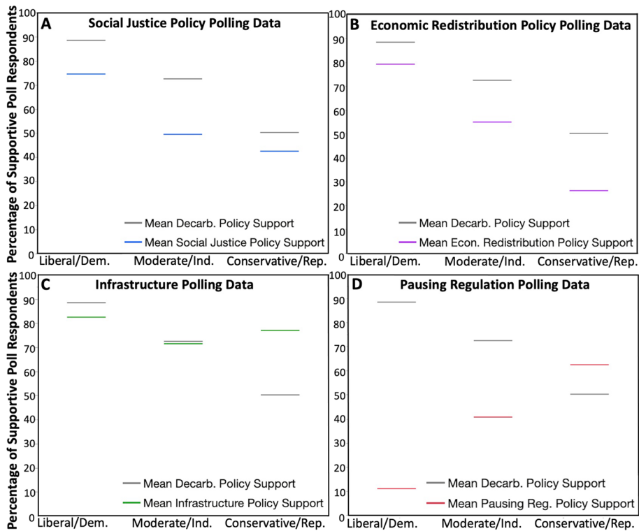
Fig. 1 Polling data regarding U.S. voters' support for decarbonization policies (gray lines on each panel) and other policies considered in this study. The x-axis shows political ideology from Liberal/Democrat to Moderate/Independent to Conservative/Republican. Polling data from the sources in Table S2 are averaged for Liberal/Democrats, Moderate/Independents, and Conservative/Republicans for each of the categories. Panel A includes polling data from Citizens for Responsible Energy Solutions (CRES) February 2022 and Pew Research Center January 2022. Panel B includes polling data from CRES February 2022, Pew Research Center September 2019, and July 2020. Panel C includes polling data from CRES February 2022, YouGovAmerica January 2018, and AP-NORC July 2021. Panel D includes polling data from CRES February 2022, Pew Research Center December 2016, and February 2019

To validate the appeal of the policies across the ideological spectrum, Fig. 1 summarizes results of major national polls for policies similar to those in our treatments. See Supplementary Information (SI) Table S2 for details on the policies used for comparison and how closely they match the policies used in the study. The decarbonization, economic redistribution, and social justice policies are disproportionately supported by liberals, with decarbonization being the most popular of these. Reducing environmental regulation is disproportionately supported by conservatives and unpopular overall compared to the others. Infrastructure is largely non-partisan and relatively popular.