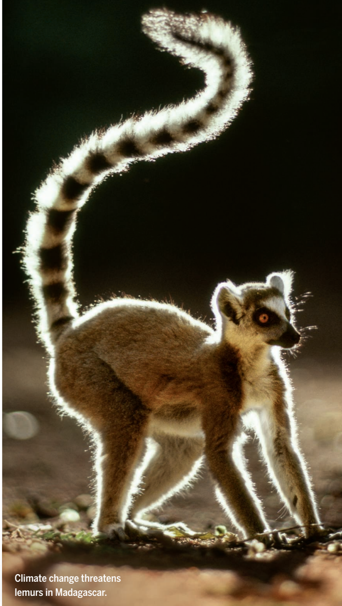
Climate change threatens lemurs in Madagascar.

understand how cells coordinate these processes during starvation, Rambold et al. tracked fluorescently labeled FAs in live mouse cells. Enzymes called lipases freed FAs from lipid droplets, allowing their transfer to highly fused mitochondria located nearby. Autophagy, an intracellular degradation process, replenished FAs to lipid droplets. Such careful coordination allows cells to generate substrates for mitochondrial energy production while preventing free FAs-related toxicity. — MSM