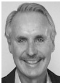
Professor Arizona State University College of Law