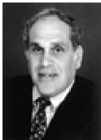
Professor University of Tulsa College of Law