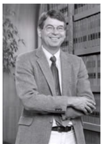
Warren Distinguished Professor University of San Diego School of Law