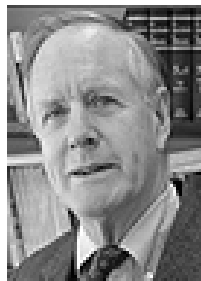
University Professor Columbia Law School