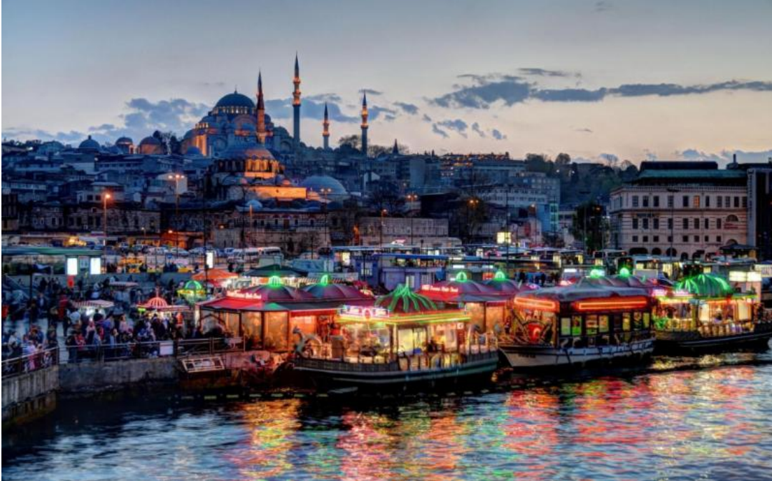
Image from http://www.boomsbeat.com/articles/1063/20140309/35-amazing-photos-of-istanbul-turkey-the-third-largest-city-in-the-world.htm

In this program, students will spend two weeks in Istanbul, a world heritage site, a global mega-city where people from urban and rural environments, different social classes, multiple cultures and religious backgrounds, coexist. The crossroads of civilization for at least 500 years, Istanbul is the perfect place to study the history of interaction between Jews and Muslims. This program will allow CU students access to otherwise inaccessible sites, including cemeteries, synagogues, monasteries, mosques, and museums.