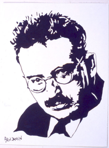
German-Jewish writer Walter Benjamin

**Meets Core Requirement for Human Diversity**