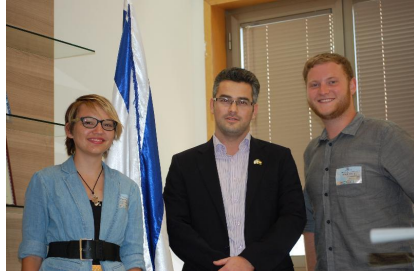
CU Students Ellyse Dick and Samuel Lentz with Knesset MP, Boaz Toporovsky

national village of Neve Shalom/Wahat al-Salam .