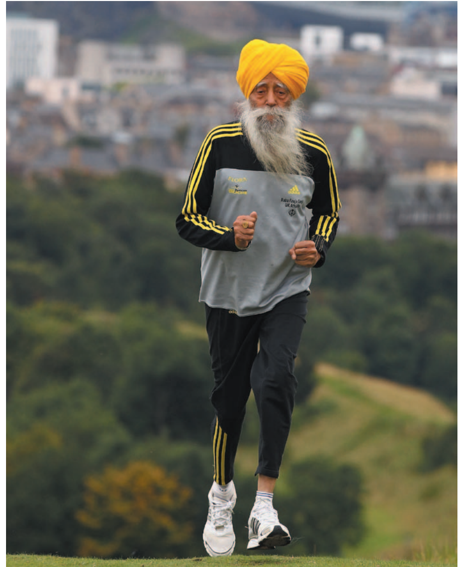
Fauja Singh, here aged 100, prepares for Britain's Edinburgh marathon in 2011.

URBANIZATION In defence of Chinese mountain-levelling scheme p.410