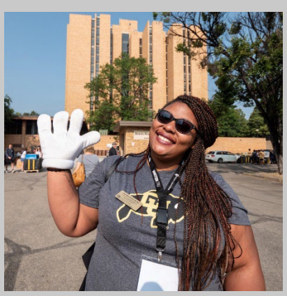
Be Involved. Contributions to our <u>IAFS Program general gift</u> <u>fund</u> are used for a variety of special projects, graduation, and student programming.