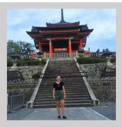
Help International Affairs continue to support students in studying abroad and join us in growing our global grants endowment by giving today.