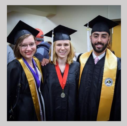
Contributions to our IAFS general gift fund are used for a variety of special projects and student programming.