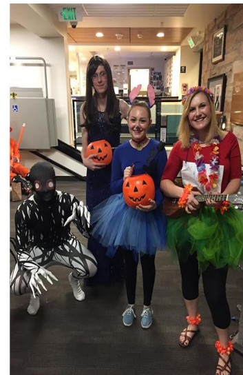
The flock leaders decked out in their Halloween costumes (left) and the costume contest winners (right)