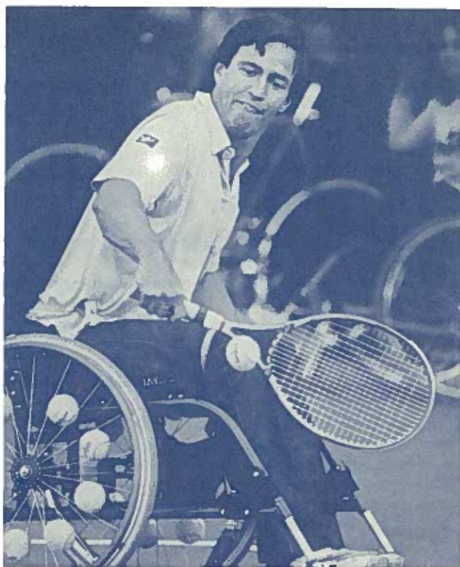
Tennis on wheels at CU-Boulder.

What is a learning disability? It is a neurological dysfunction that interferes with an individual’s information processing.